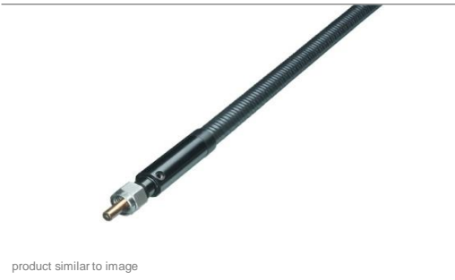
product similar to image

| Photonics Solutions | | Materials Processing Solutions |