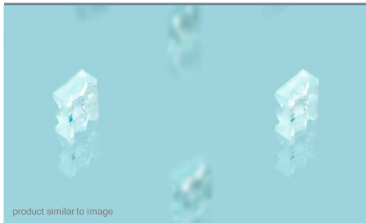
product similar to image