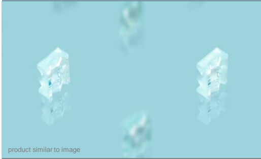
product similar to image