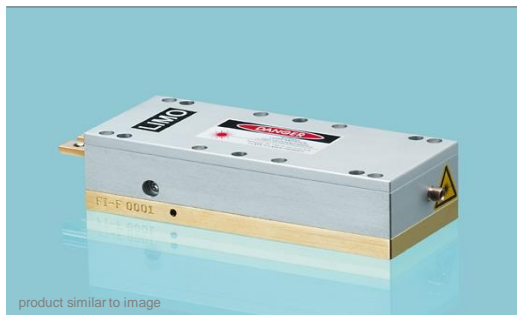
product similar to image