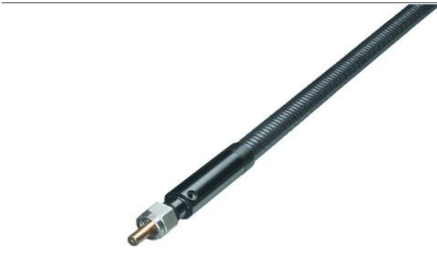
product similar to image

| Photonics Solutions | | Materials Processing Solutions |