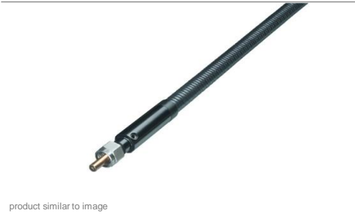
product similar to image

| Photonics Solutions | | Materials Processing Solutions |