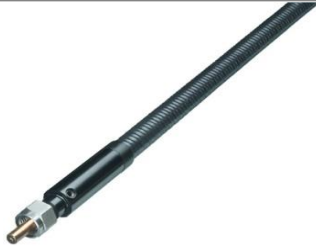
product similar to image

| Photonics Solutions | | Materials Processing Solutions |